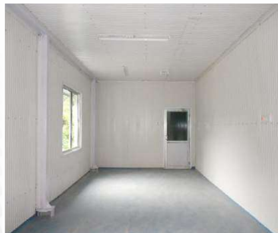
INSIDE VIEW - SIKKIM POLICE