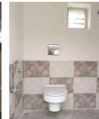
TATA STEEL LIMITED