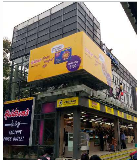
HALDIRAM FOOD COURT SEALDAH STATION