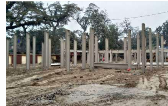
STRUCTURE ERECTION AFTER CIVIL FOUNDATION