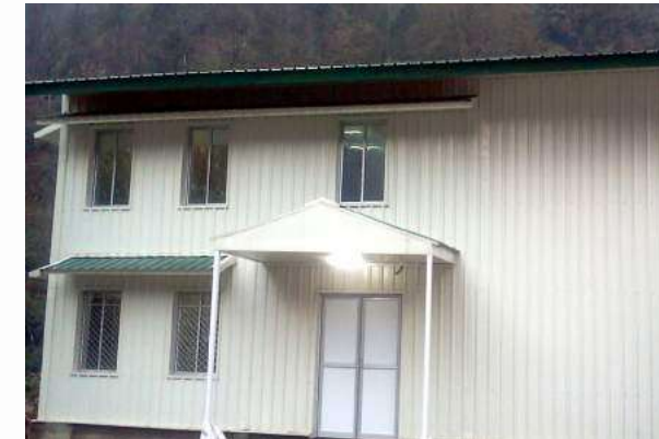
SIKKIM POLICE, CHUNGTHANG