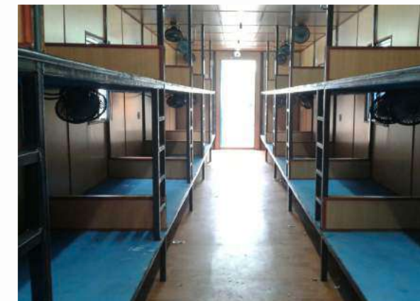
TITAGARH WAGONS LTD