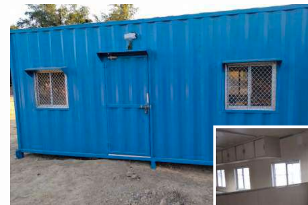
LARSEN & TOUBRO