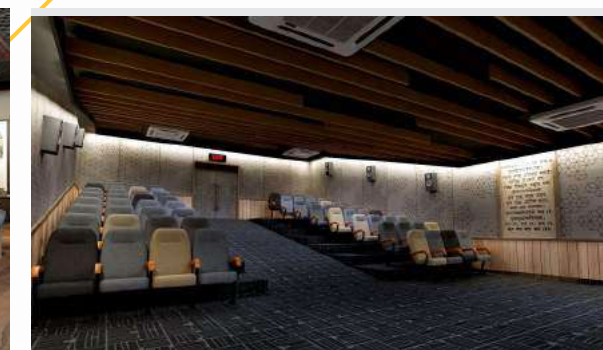
INTERIOR VIEWS - MAITREE MUSUEM